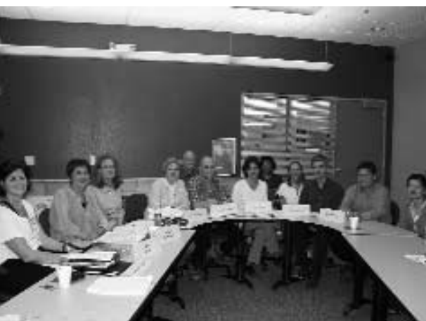
The SOC meets the 2nd Thursday of each month.