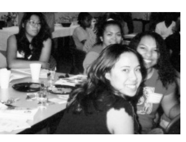
ACE (Achieving a College Education) is a scholarship-based program that makes it possible for high school students with limited resources to seriously consider attending college. Mesa Community College's ACE program, which has a service-learning component, is called REACH

(Raising Expectations for Achievement and Community Service through Higher Education).