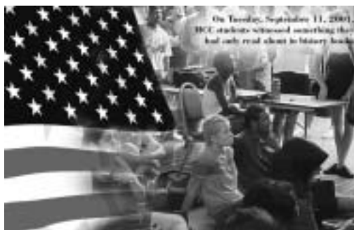
Graphic inserted in an e-mail sent out to commemorate the first anniversary of 9-11.

Individuals interested in learning basics on inserting graphics, logos, and formatting are encouraged to attend the Art of E-mail Graphics workshop offered through the Center for Teaching and Learning (CTL). The next Art of E-mail Graphics workshop is February 17 from 3-5 PM in the CTL. To register for the class please call 461-7331 or visit ctl.mc.maricopa.edu/events/reg.jsp .